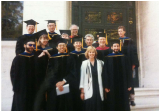
Class of 1996