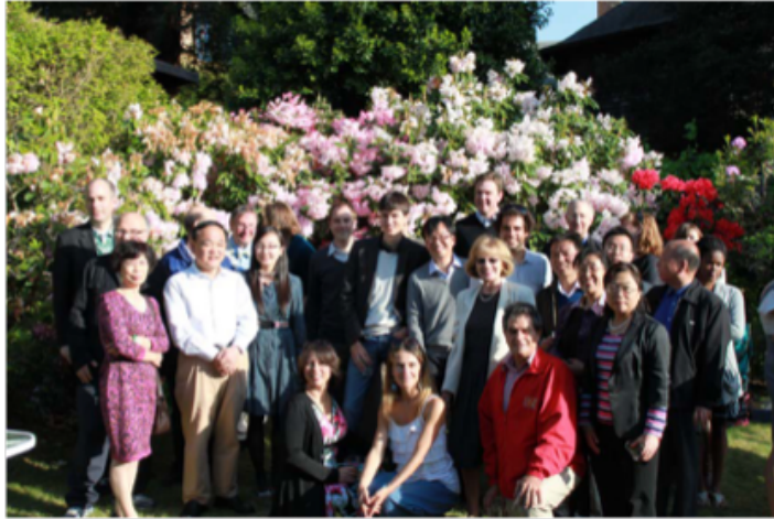
ARE Class of 2012