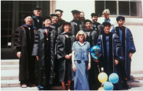
Class of 2009