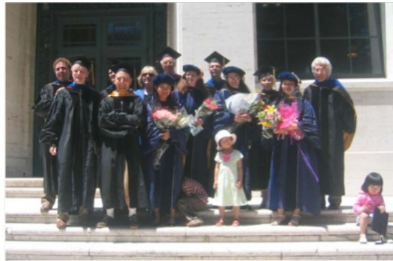
Class of 2005