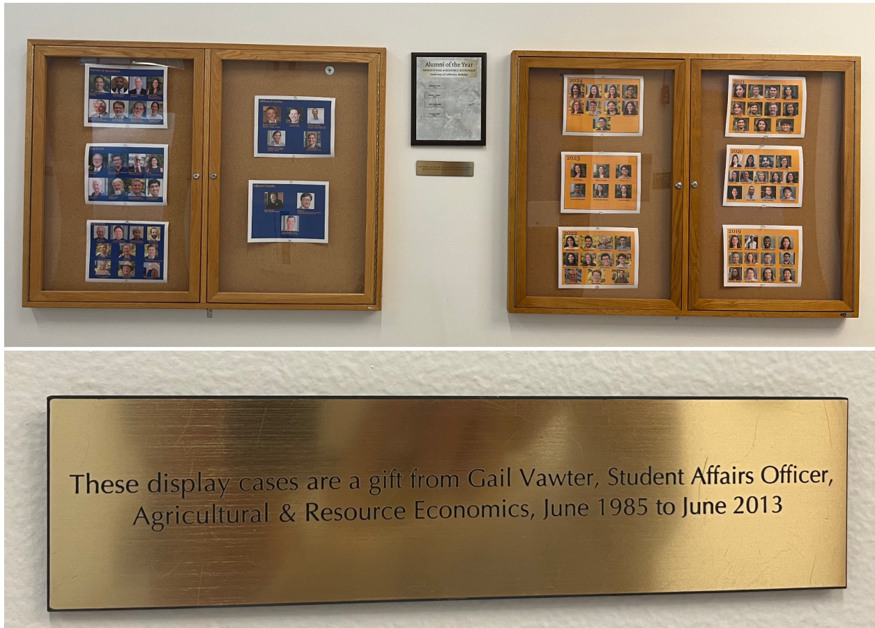
Giannini Hall, next to 203 Giannini, October 2024.