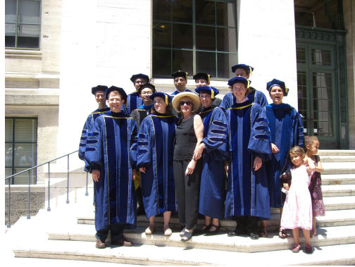
Class of 2008