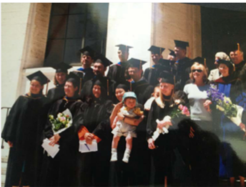
Class of 2001