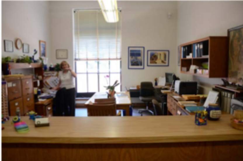
203 Giannini Hall, Last day in office in 2013