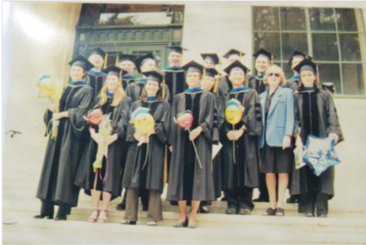
ARE Class of 2003