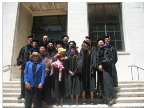
ARE class of 2007