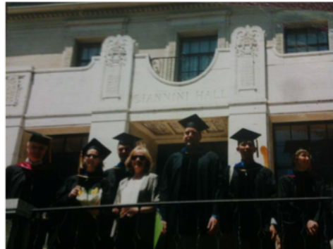
Class of 2000