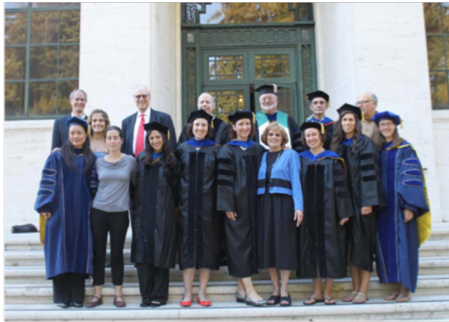
Class of 2013