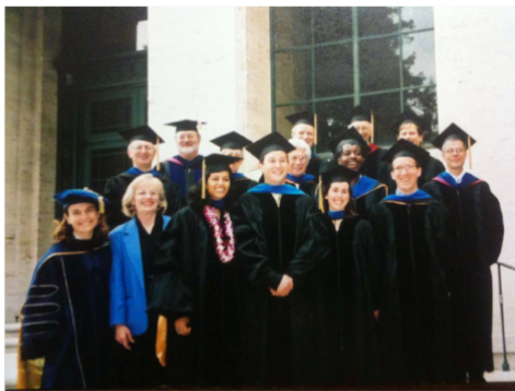
Class of 2006