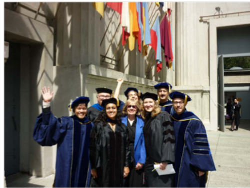
ARE Class of 2010