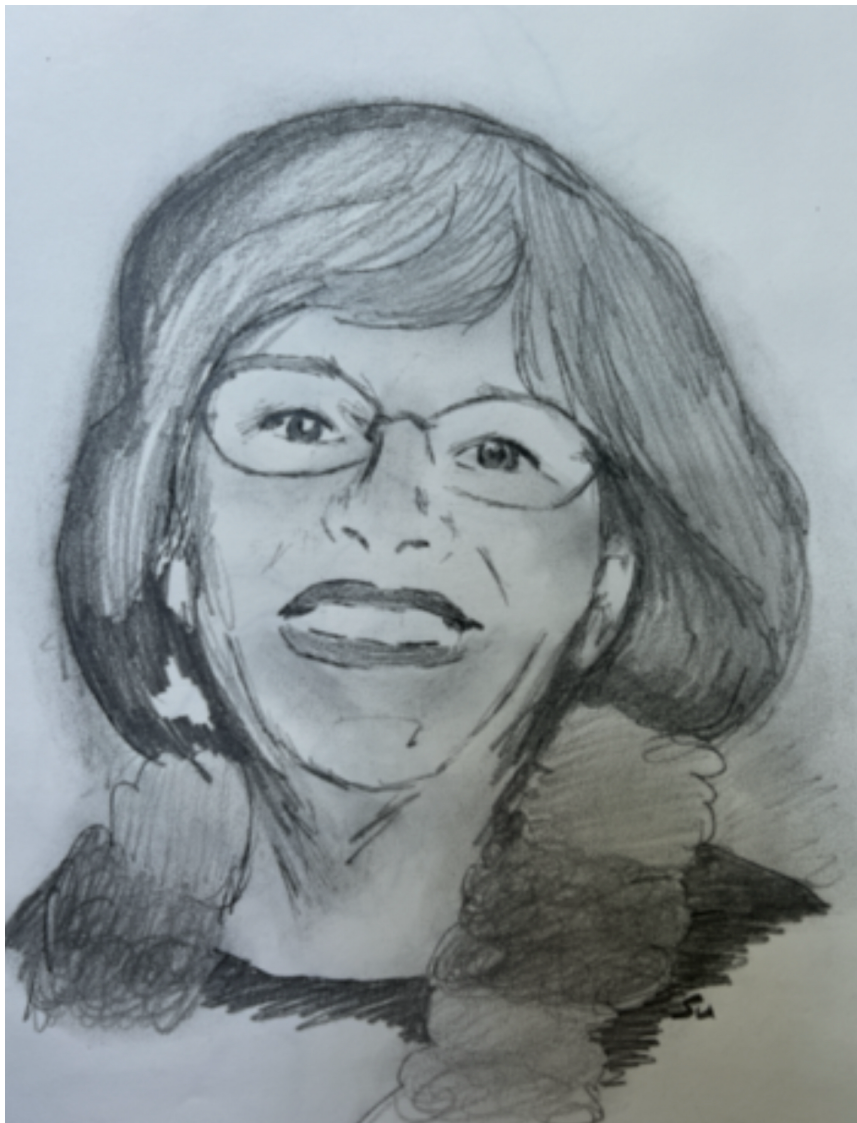
Su, October 19, 2024, Charcoal