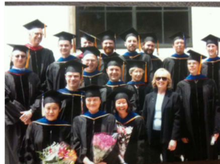
Class of 2002