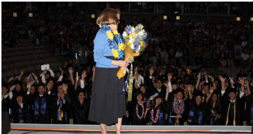
At the Greek, May 19, 2013