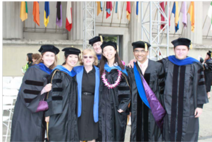
ARE Class of 2011