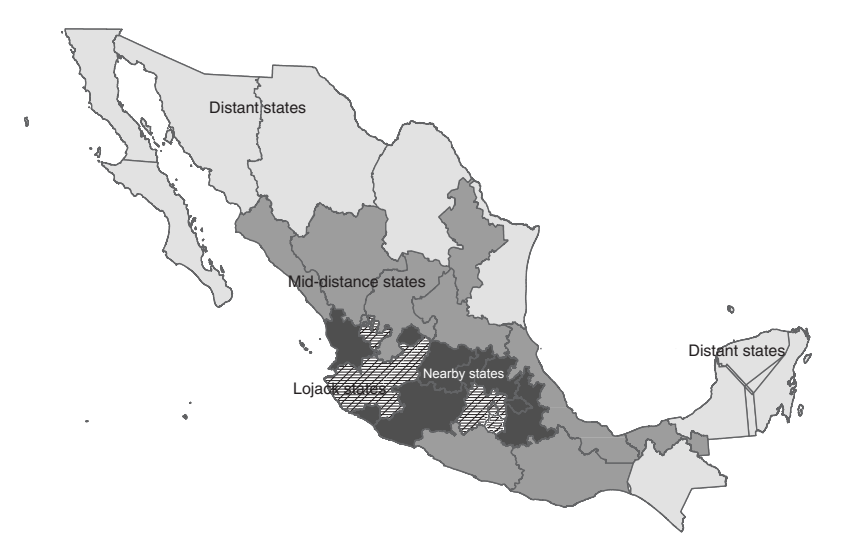
FIGURE 1. LOJACK STATES AND NON-LOJACK STATES

Notes: Non-Lojack states grouped by terciles of distance from state capital to nearest Lojack state capital.