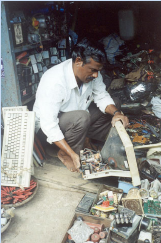
A man in India handling a CRT monitor tube.