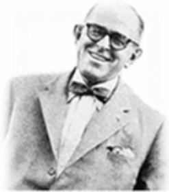
C.V. Starr, c. 1964