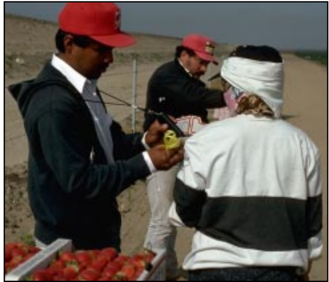
Electronic counting of units produced lends to efficient and accurate payroll preparation.